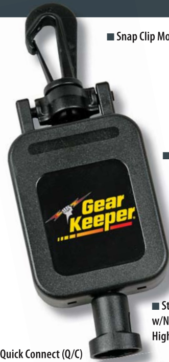
■ Snap Clip Mount